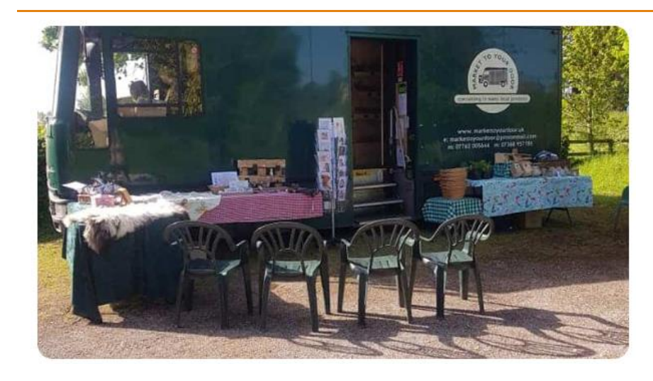
Market To Your Door

"We gained so many new customers that initially we were almost overwhelmed with demand but as things calmed down and time progressed so did the service."